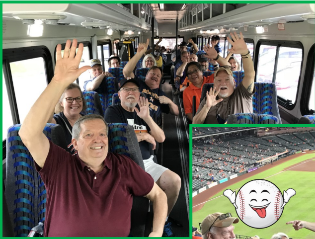
Let's Go, Let's Go, Let's Go to the Ball Game!!!