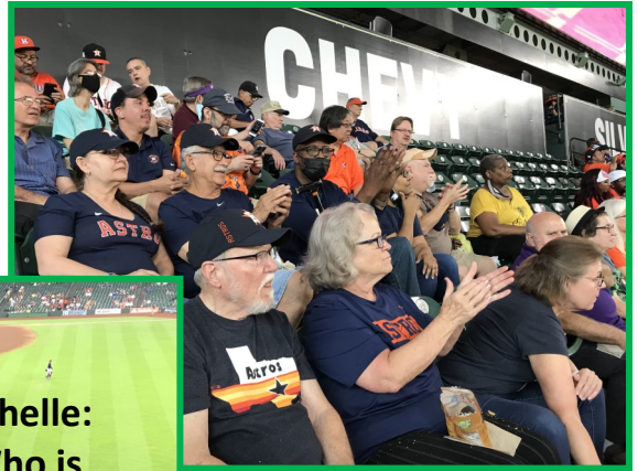
Astro Player Yuli made the homerun, FINALLY!