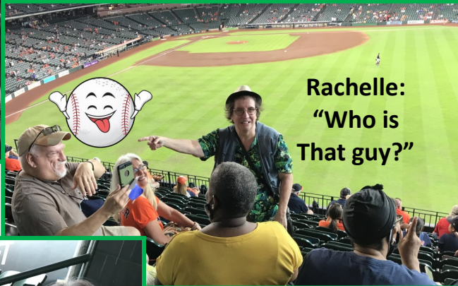
Rachelle: "Who is That guy?"