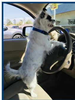
Cookie Dermon Look! I'm driving!