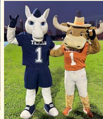
Texas School of the Deaf Mascot University of Texas Mascot

TSD had its 2025 Homecoming weekend. It was a hectic weekend with nine different deaf state schools hosting volleyball tournaments and cross-country competitions from Friday through Saturday. In Cross country, one TSD boy won first place. In the Volleyball tournament, TSD finished in second place, while Maryland took first place.