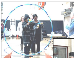
Shooting Snowballs Cup Game