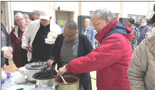
Special Thanks to all who bought salads and bread.

https://ammo.com/articles/arming-elderly-self-defense-guide-senior-citizens