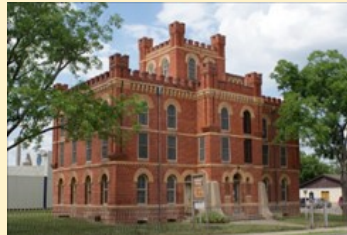
Caldwell County Jail Museum