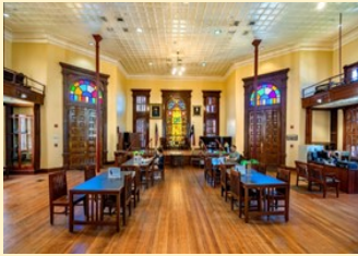
Dr. Eugene Clark Library