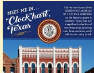
The Southwest Museum of Clocks & Watches