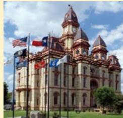
Caldwell County Courthouse