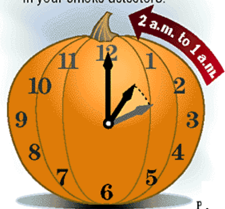
Sunday, November 3rd