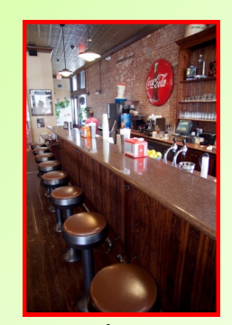
Luncheon at Another Time Soda Foundation On Your Own