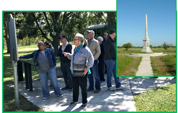
The Goliad massacre was an event of the Texas Revolution that occurred on March 27, 1836, following the Battle of Coleto; 425-445 prisoners of war from the Texian Army of the Republic of Texas were executed by the Mexican Army in the town of Goliad, Texas.

What a beautiful piece of our rich Texas heritage! This is an incredible example of the 1700's Mexican architecture, beautifully restored. Walking around this compound is like stepping inside a history book. It's so much more impressive to experience it than to just read about it or look at pictures. The exhibits in the museum are excellent and help give us a feeling of what it was like to actually be there over 250 years ago.