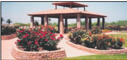
South Texas Botanical Gardens and Nature Center