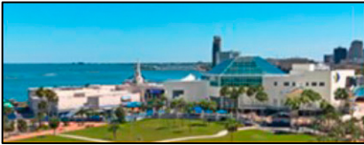
Texas State Aquarium