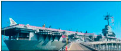
USS Lexington Museum

Cost: $140 Per Person* — Lunch and Dinner On Your Own