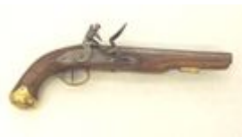
Star of the Republic Museum