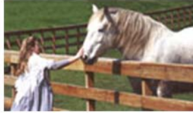
Barrington Living History Farm

Birthplace of Texas Washington-on-the-Brazos 10:00 AM — 12:30 PM