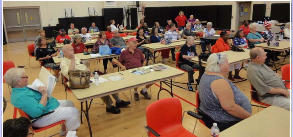
Meeting before Luncheon