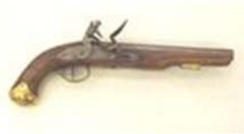
Star of the Republic Museum