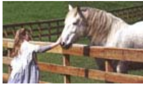
Barrington Living History Farm

Birthplace of Texas Washington-on-the-Brazos 10:00 AM — 12:30 PM