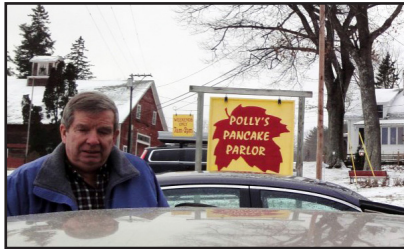
My Favorite Pancake House