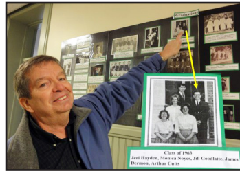
My Graduation 1963