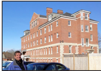
Austine School in Vermont