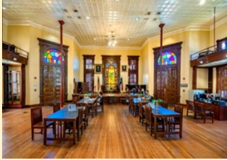
Dr. Eugene Clark Library