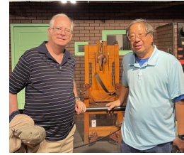
Sam Houston Museum Texas Prison Museum Sam Houston Statue

On October 14 th , it was a gorgeous day, not a cloud in the sky. There was a cool breeze, much improvement from our hot weather during August and September. Thirty seniors got on the bus and on our way to meet the last six seniors at Huntsville. We visited the Sam Houston Memorial Museum, the Texas Prison Museum, and the Sam Houston Statue. Before we went to the statue, we had lunch at Farmhouse Café.