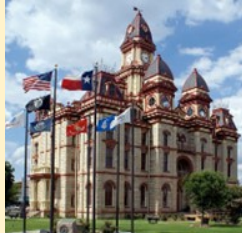
Caldwell County Courthouse