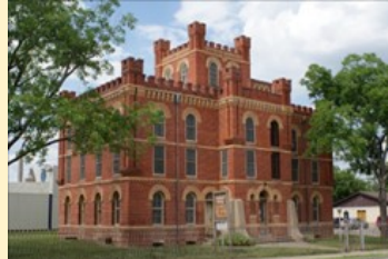
Caldwell County Jail Museum