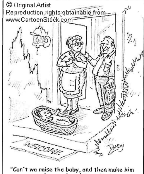
pay for our Social Security?"