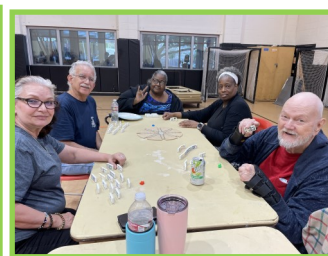
Mexican Train Game Dominoes