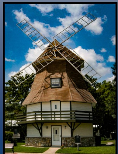
Dutch Windmill Museum