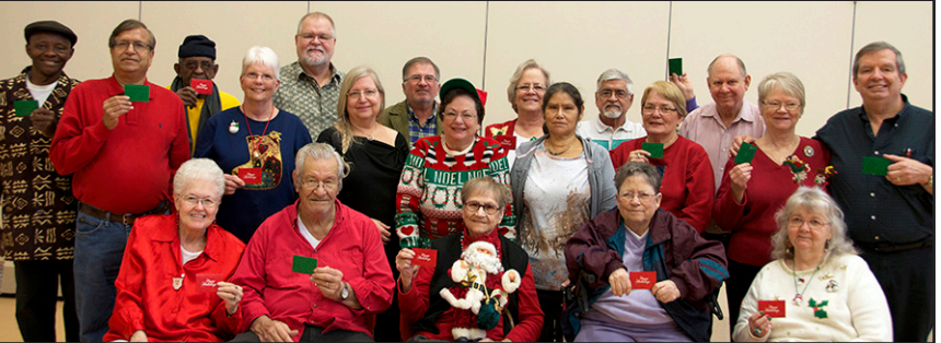
Winners got the Christmas gift cards.