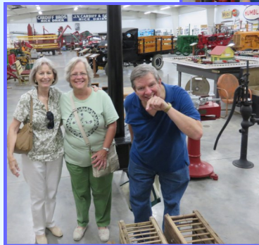
Some of us, who grew up in a farm, talked about our wonderful memory of our farm life and the farm machinery — tractors, milk-cream separator, chicken cage, flat-bed trucks and many more.