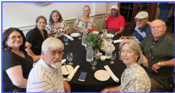
Wow! Very nice café...wonderful food...wonderful staff workers. The café opens from 11:00 am to 2:00 pm every-day.